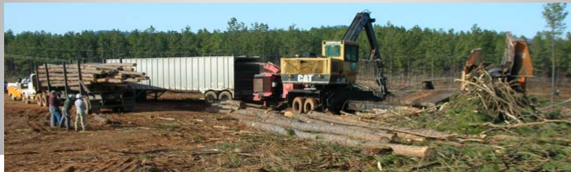
Skid, De-limb, Buck, Chip, Load & Haul 4